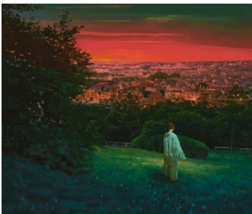
Keita Morimoto, After Light , 2021