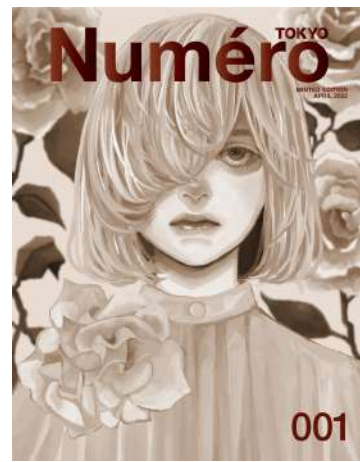
<西 ✕ NISHI>