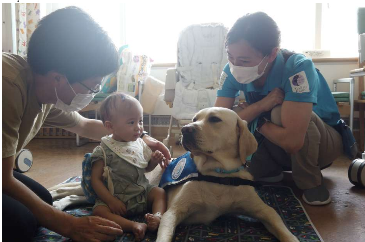
Enjoying interaction in the hospital ward

The Hospital Facility Dog Program is an animal-assisted therapy program that pairs a "Hospital Facility Dog," a dog that has received professional service dog training for roughly 1.5 years to work in a children's hospital, with a nurse or other healthcare professional who has completed training to become a professional dog "handler" in a children's hospital environment. This program supports hospitalized children and their families through a variety of interactions with the dog team - from friendly visits and cuddles, to rehabilitation activities and support during medical procedures.