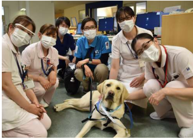
At the staff station in the hospital ward