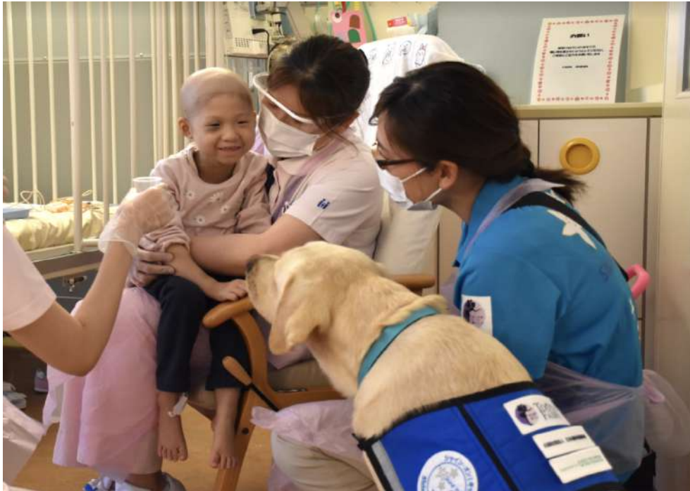
Internal medication support

Shine On! Kids Hospital Facility Dogs work at the same hospital every day, bringing the medical expertise of their handlers to meet the needs of individual families. Thanks to rigorous infection control measures, there have been no infection-related incidents or issues in the past 11 years with our dogs. Throughout the COVID19 pandemic, Shine On! Kids' program has continued at its three hospitals: Shizuoka Children's Hospital, Kanagawa Children's Medical Center, and Tokyo Metropolitan Children's Medical Center. When the initial state of emergency was declared in Japan, some aspects of the program were curtailed as a precaution, but through cooperation and collaboration with the infection control officers at each hospital, the Hospital Facility Dogs continued visiting patients without a single interruption. Vaccination of all handlers was completed in June this year.