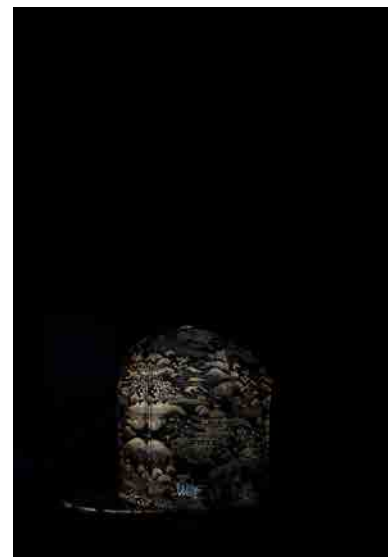
EVOSHi #003 (Side of CAP)