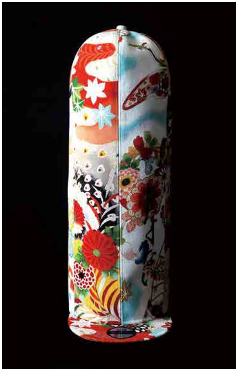
KIMONO ART CAP "HIRAGANA" Height: Approx. 53cm | Head circumference: Approx. 56-62cm (roughly M-L) A model crafted using vintage kimono fabric and finished with silk screen printing.

Art Cap Collection: https://www.toshixxx.com/all-view