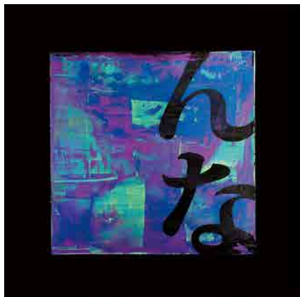
Abstract painting expression with "HIRAGANA" #Blue