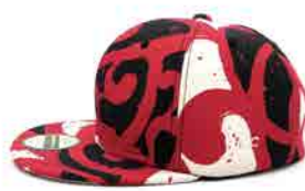
ALOHA CAP (made from fabric deconstructed from vintage aloha shirts)