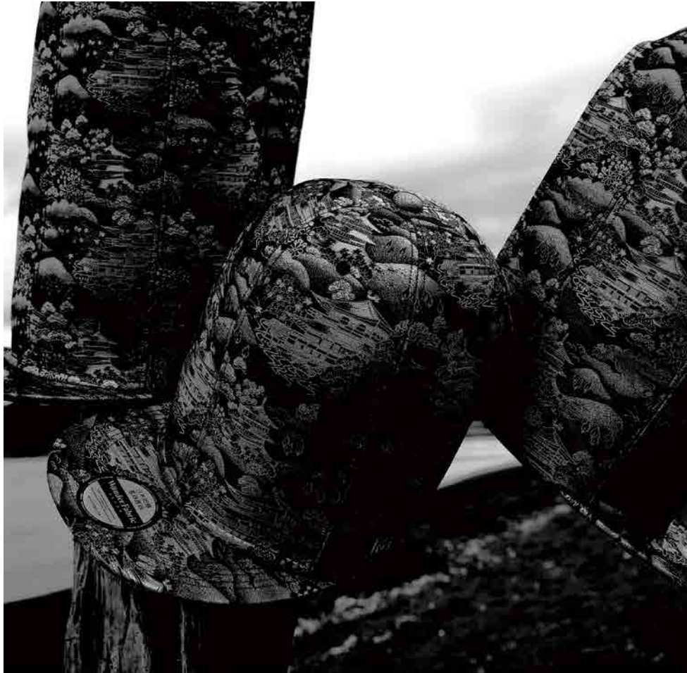
Visuals of the main image of the art cap.

W@nder Fabric® (Wonder Fabric) upcycles vintage kimonos and fabrics to create luxurious caps. With its unique designs, it redefines the possibilities of headwear. We are actively expanding into overseas markets, focusing on Europe and Asia, while growing our sales network.