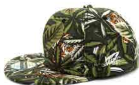
ALOHA CAP (made from fabric deconstructed from vintage aloha shirts)

Site listed : https://wonderfabric-store.com