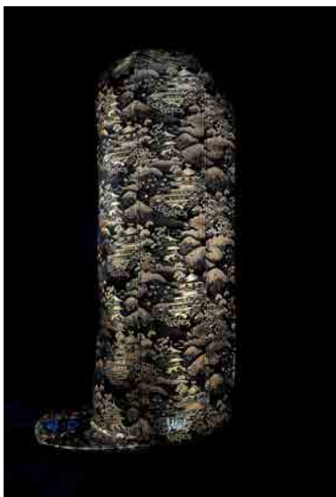
EVOSHi #001 (Side of CAP)

This cap is a fusion of upcycling and contemporary sensibility, crafted by deconstructing vintage wear and old kimonos to give them new life as unique materials. A special piece that effortlessly incorporates art into everyday life, it transforms vintage fabrics and kimono textiles into a new form, adding individuality and storytelling to your style.