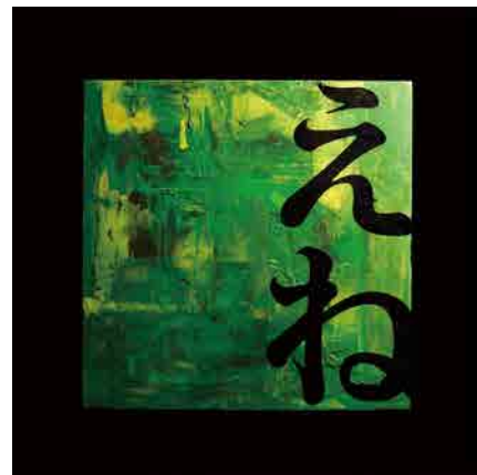
Abstract painting expression with "HIRAGANA" #Green