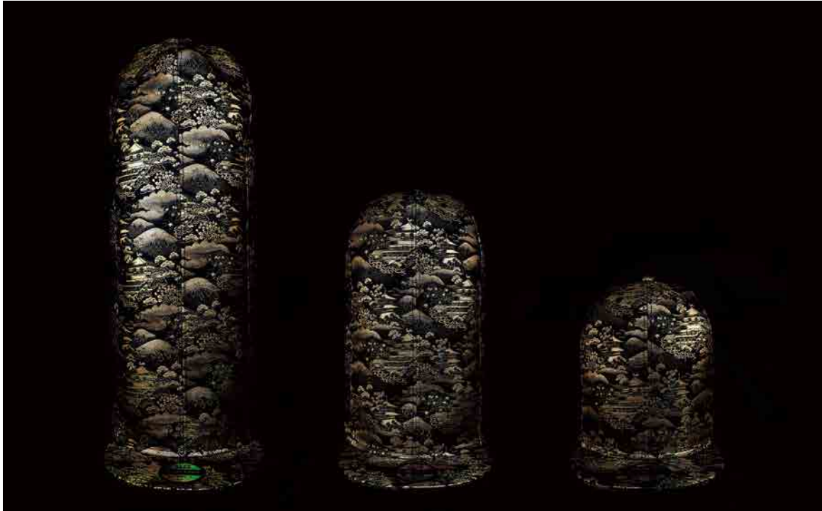
Series name: "EVOSHi" (The photos are for reference; vintage kimono fabric is reused). Custom orders are available for fabric selection, height, and size variations. From left: EVOSHi #001 (height approx. 53cm), #002 (height approx. 35cm), #003 (height approx. 23cm). All have a head circumference of approximately 56–62cm. Sizes can be adjusted and modified up to XXL.

Art of Peace Inc. ( https://www.artofpeace.tokyo ) is pleased to announce the launch of a one-of-a-kind art cap by W@nder Fabric® founder TOSHİ, themed around "Art in Everyday Life." In addition, we are now accepting orders for custom-made caps.