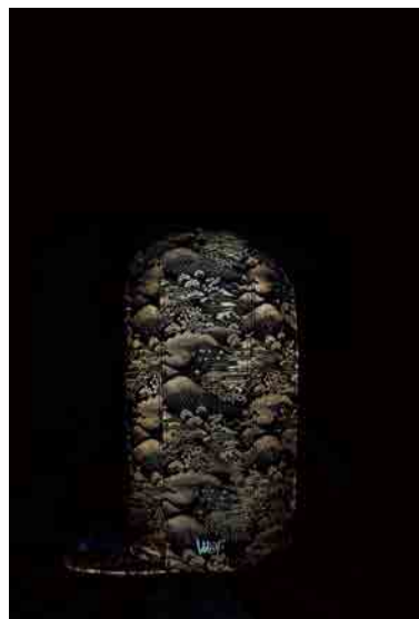
EVOSHi #002 (Side of CAP)