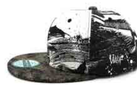
TANGO CHIRIMEN MIX CAP (Made from Kyoto Tango crepe).