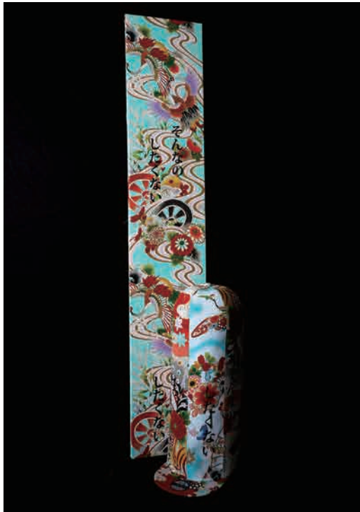
Kimono Fabric Art Panel & KIMONO ART CAP

Link to Art Goods Collection : https://www.toshixxx.com/all-view