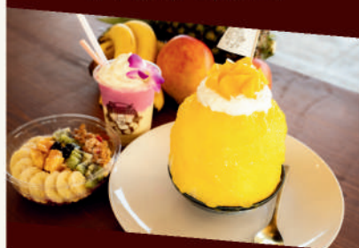
O ice cafe