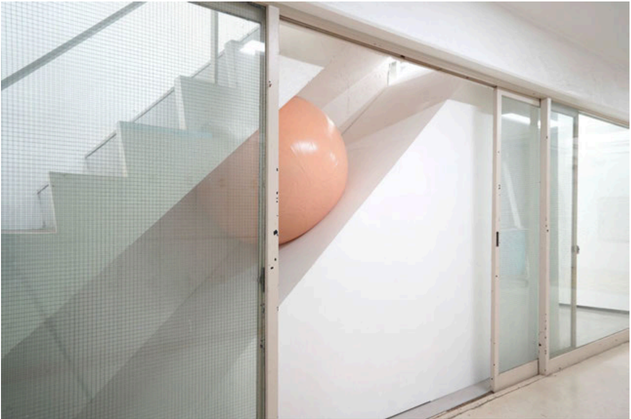
"Untitled(Squashed Ball)" 2022 wood, rubber ball dimensions variable