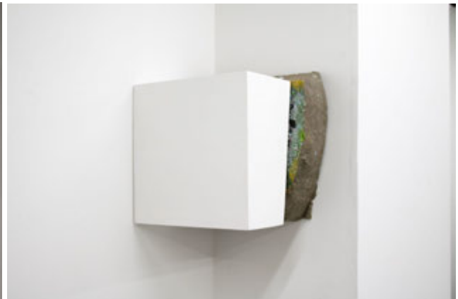
left: "Untitled" 2024 oil and glitter on canvas, wood 250×486×309 mm