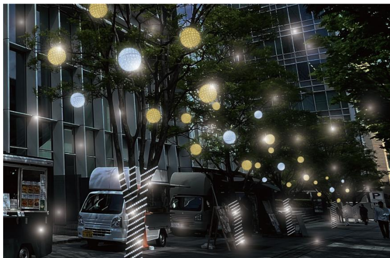
[Street Trees Illuminations] (※Image picture)

We will provide relaxing space with spherical illuminations, the circle motif of which symbolizes connection, with the hope that prosperity will come to everyone.