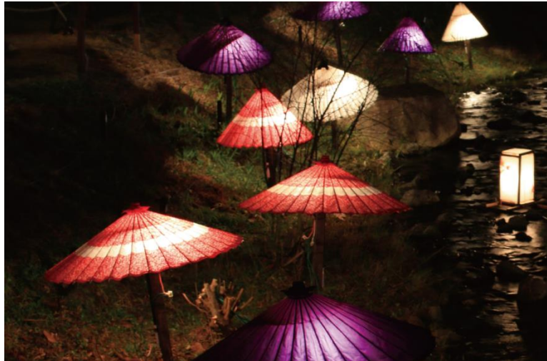
[Japanese Umbrella Illuminations] (※Image picture)

The illuminations at the entrance serves as the motif of traditional Japanese umbrellas, which are also used in Kabuki performances. Please enjoy there as a photo spot.