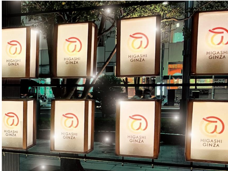
[Japanese Lantern Illuminations]

Long ago, the Tsukiji River flowed through Higashi Ginza, and a lantern festival was held there. In a nod to its elegant history, the plants around Kabukiza will be decorated with lanterns. Enjoy the warm light of the lanterns while thinking back to those days.